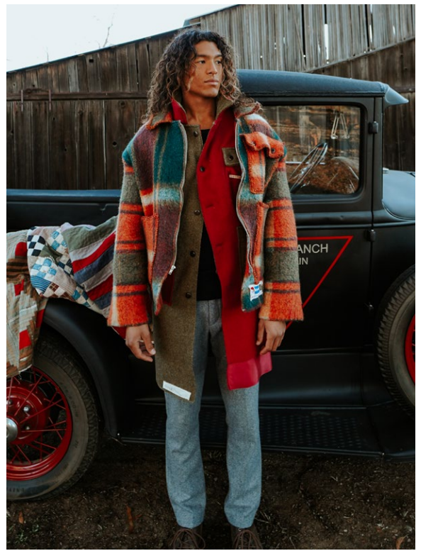
This zipper front jacket is made from a Dutch plaid blanket from c. 1940. From Zwolle, The Netherlands.

The layered long coat is made from two vintage camp blankets. A 1930's blanket from the Lisk estate in Clifton Springs, NY. And a St. Mary's burgundy wool throw from Trenton, NJ.