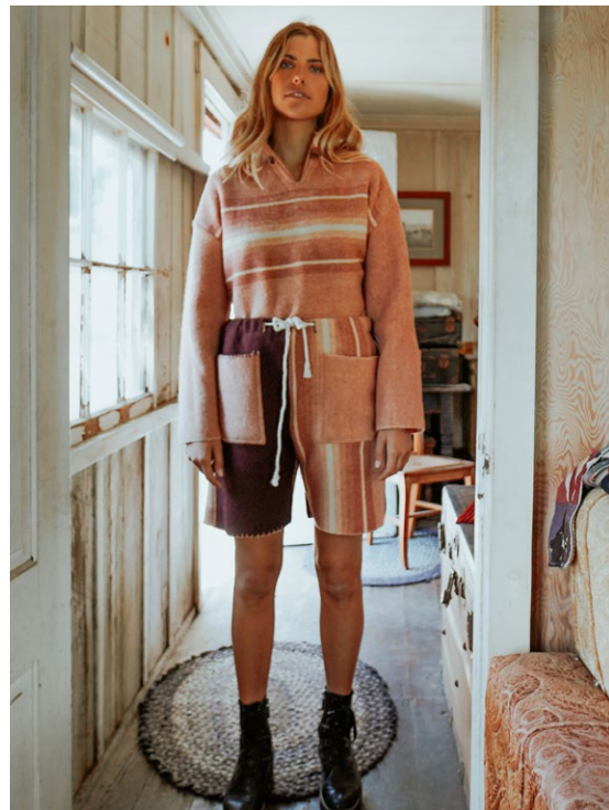
This hoodie and drawstring trouser set is made from a dusty pink wool camp cottage blanket. Removed original satin binding and stored in a closet in Ohio.