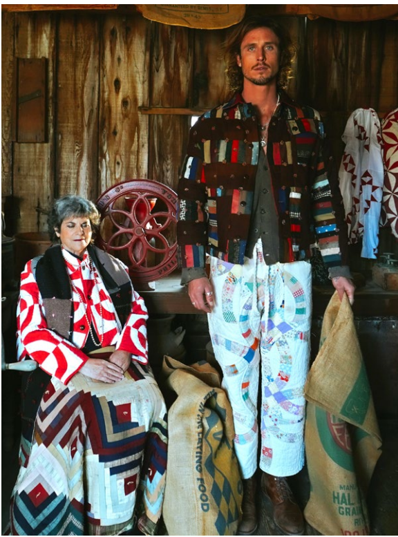
This jacket is made from a c. 1910 stacked patchwork baby quilt. Hand sewn from wool fabrics and knotted in multicolored ties.