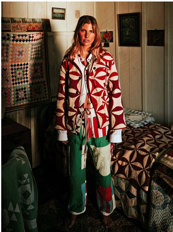
This jacket is made from a c. 1870-1880 Red and White Cathedral Window Quilt from Robbinston Maine. The shirt is made from a 1920's deconstructed red and white 9 patch quilt top from Alabama. The drawstring trousers are made from a 1900's cabin quilt.