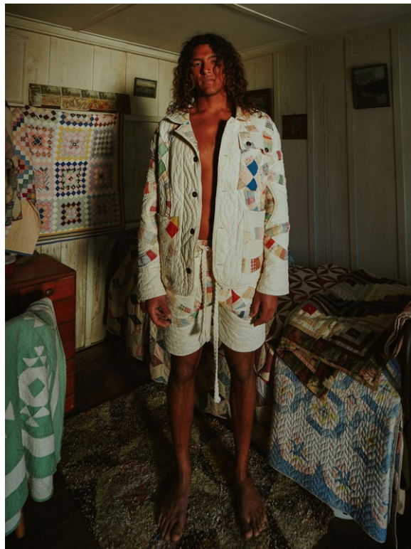
This jacket and drawstring shorts set is made from a c. 1900 wedding quilt from New Jersey.